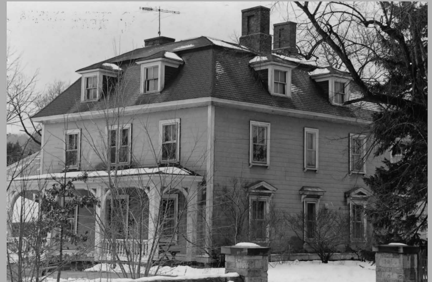
6. Nathan Hobart House, 362 Lexington St., #F143