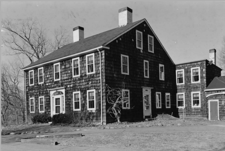
7. Jonas Clark Farmhouse, 399 Lexington St., #F148