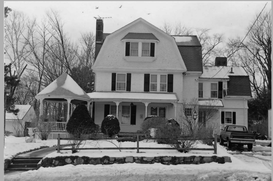
4. Sherman Hoar House, 326 Lexington St, #F138