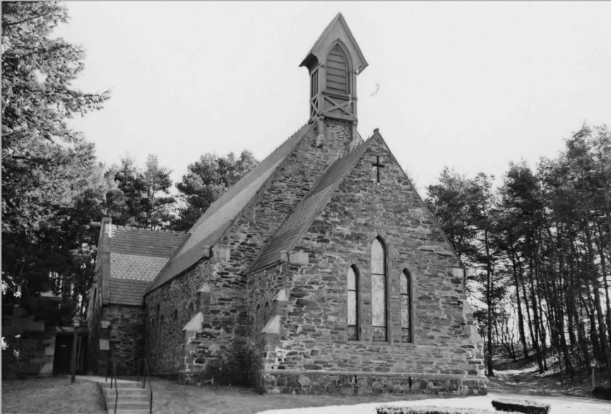
1. New Jerusalem Chapel, 379 Lexington St., #F144