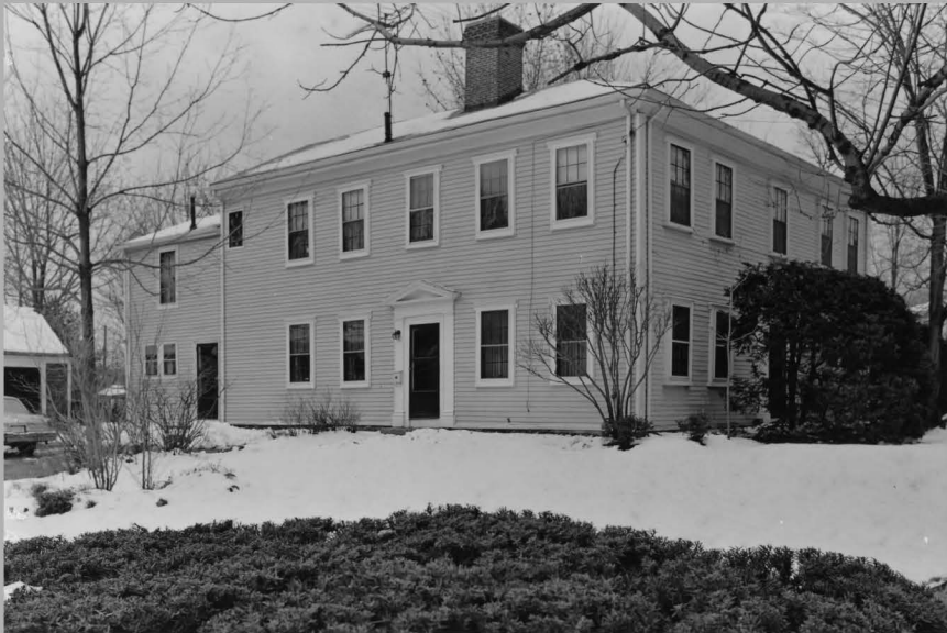
5. Sanderson-Bemis House, 380 Lexington St., #F145