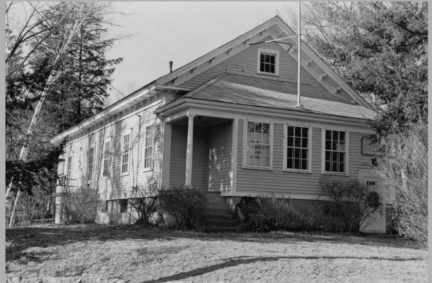
2. Pond End School / Piety Corner Club, 2 Worcester Ln, #F133