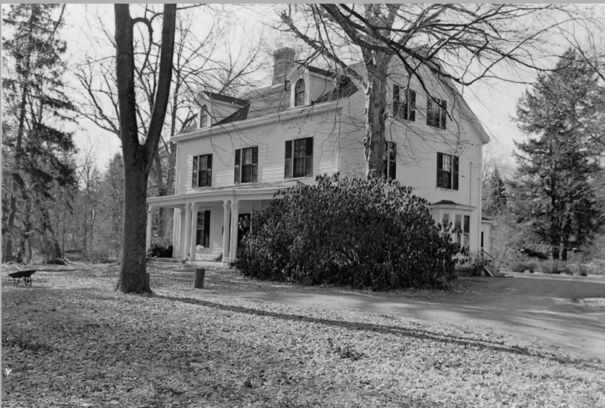
3. Benjamin Worcester House, 28 Worcester Ln, #F134