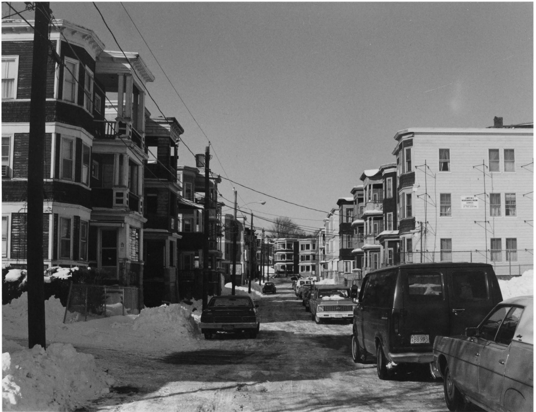
5. Juniper Street, looking north, east and west sides (Photograph: Carole Zellie, March 1983)