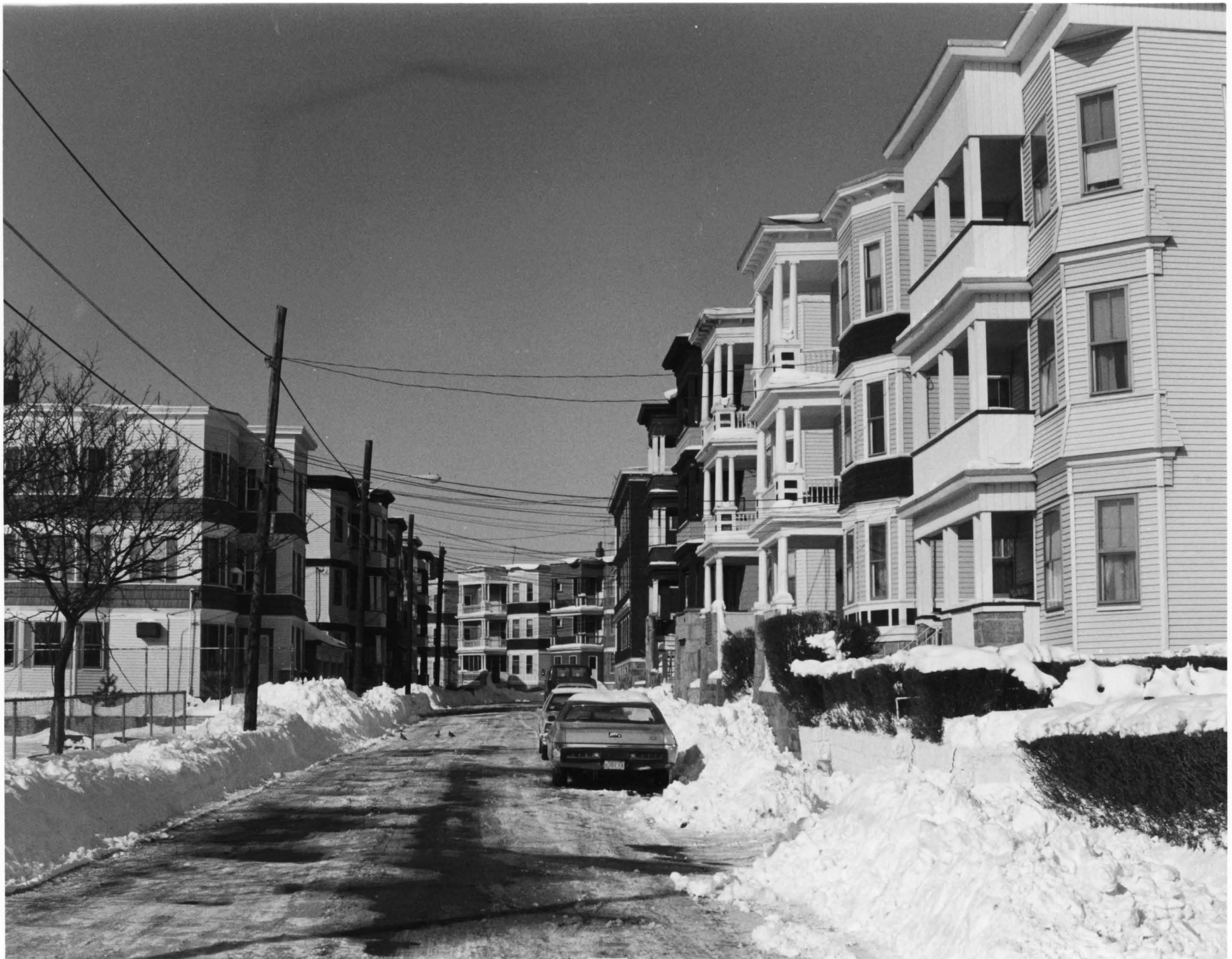
3. Poplar Street, east side looking north.