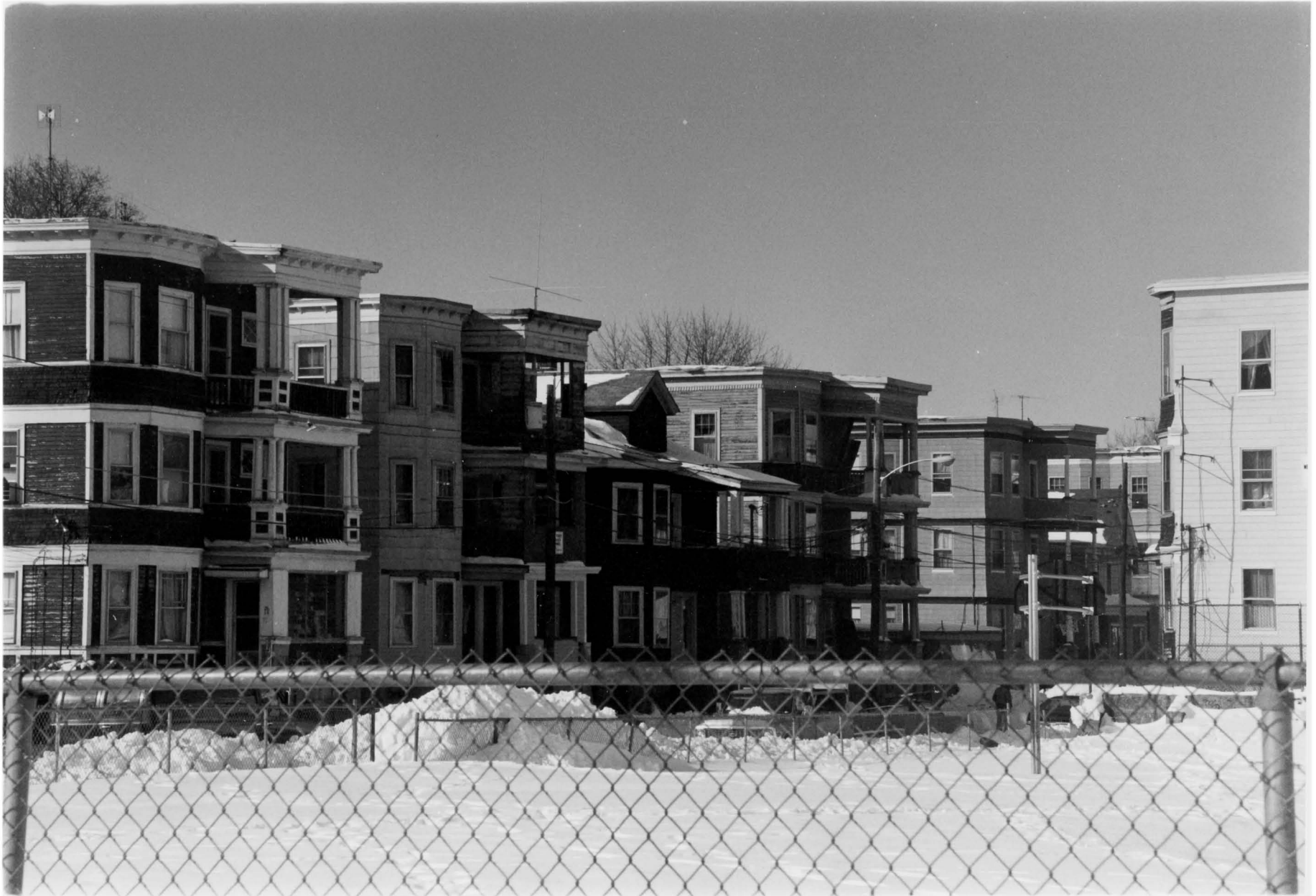
1. 31-33 Juniper Street and adjacent block, west side, looking north (Photograph: Carole Zellie, March 1983)