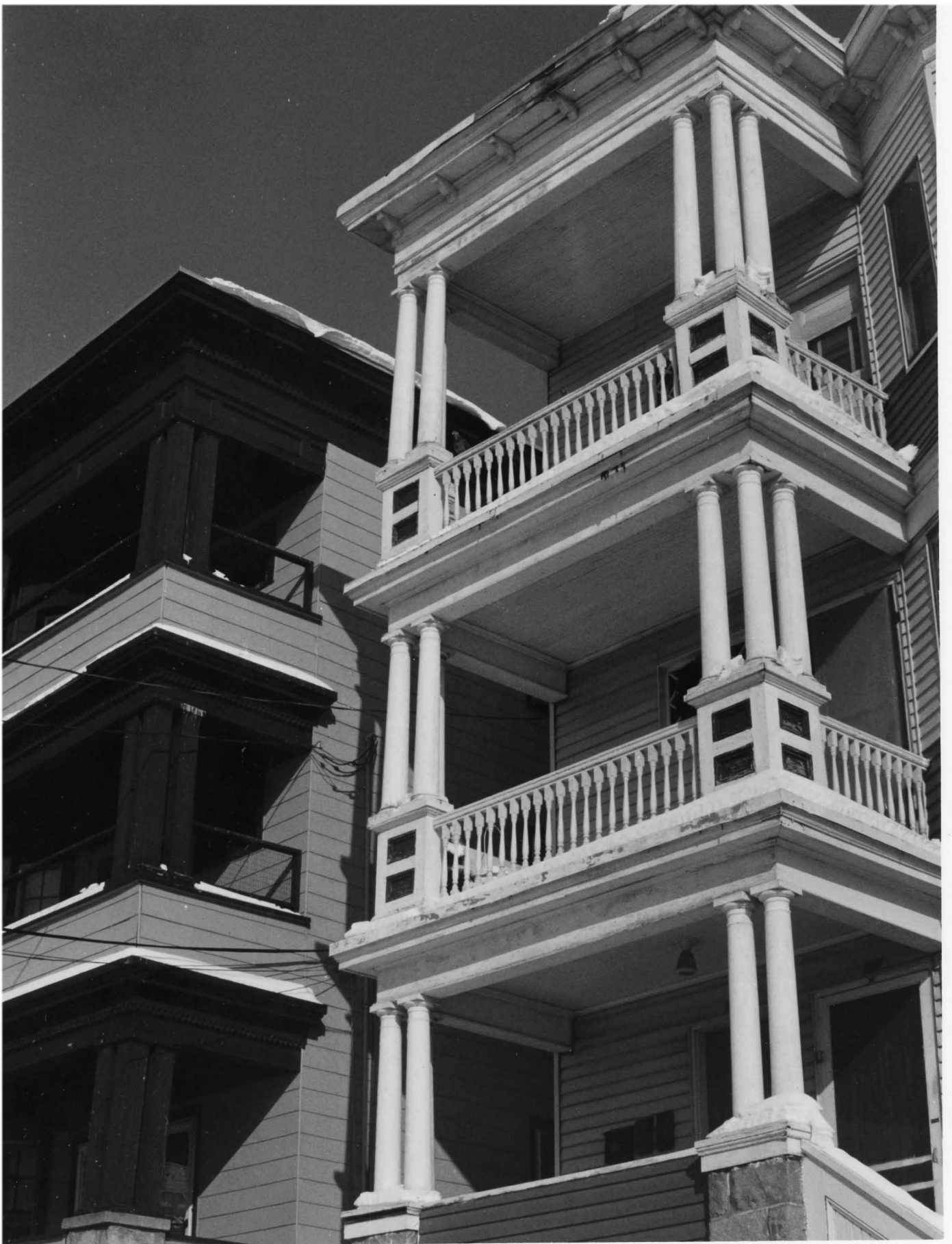
4. 9-11 Poplar, detail (Photograph: Carole Zellie, March 1983)