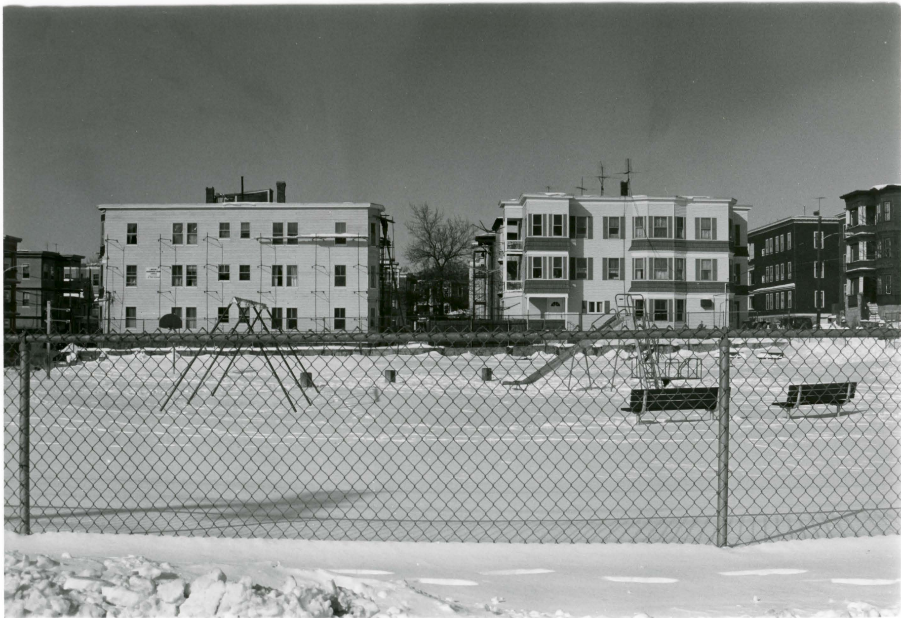
2. Tarbox School Playground, Juniper-Poplar Block