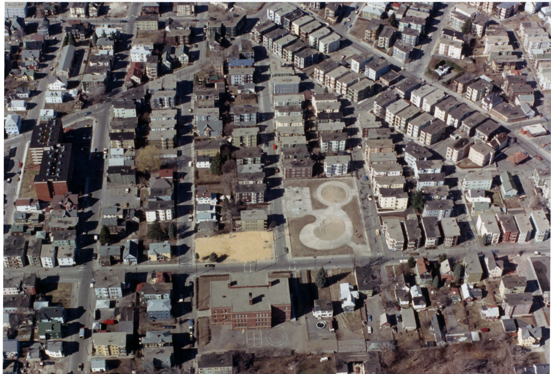
[No caption provided. ca. 1983 aerial photo of Arlington-Bassword Historic District, looking north across Alder Street (lower foreground). Tarbox School (not in district) bottom center; Poplar Street runs north along east side of Cronin Park.]