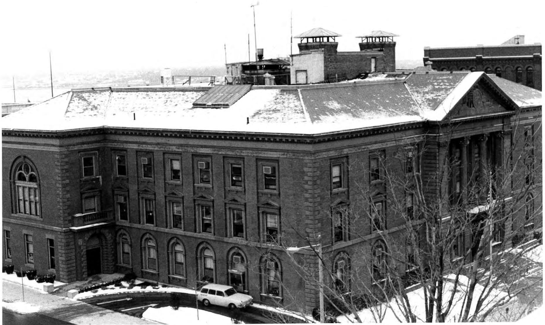
2. New Bedford City Hall, North side of William St. and west side of North Sixth St.