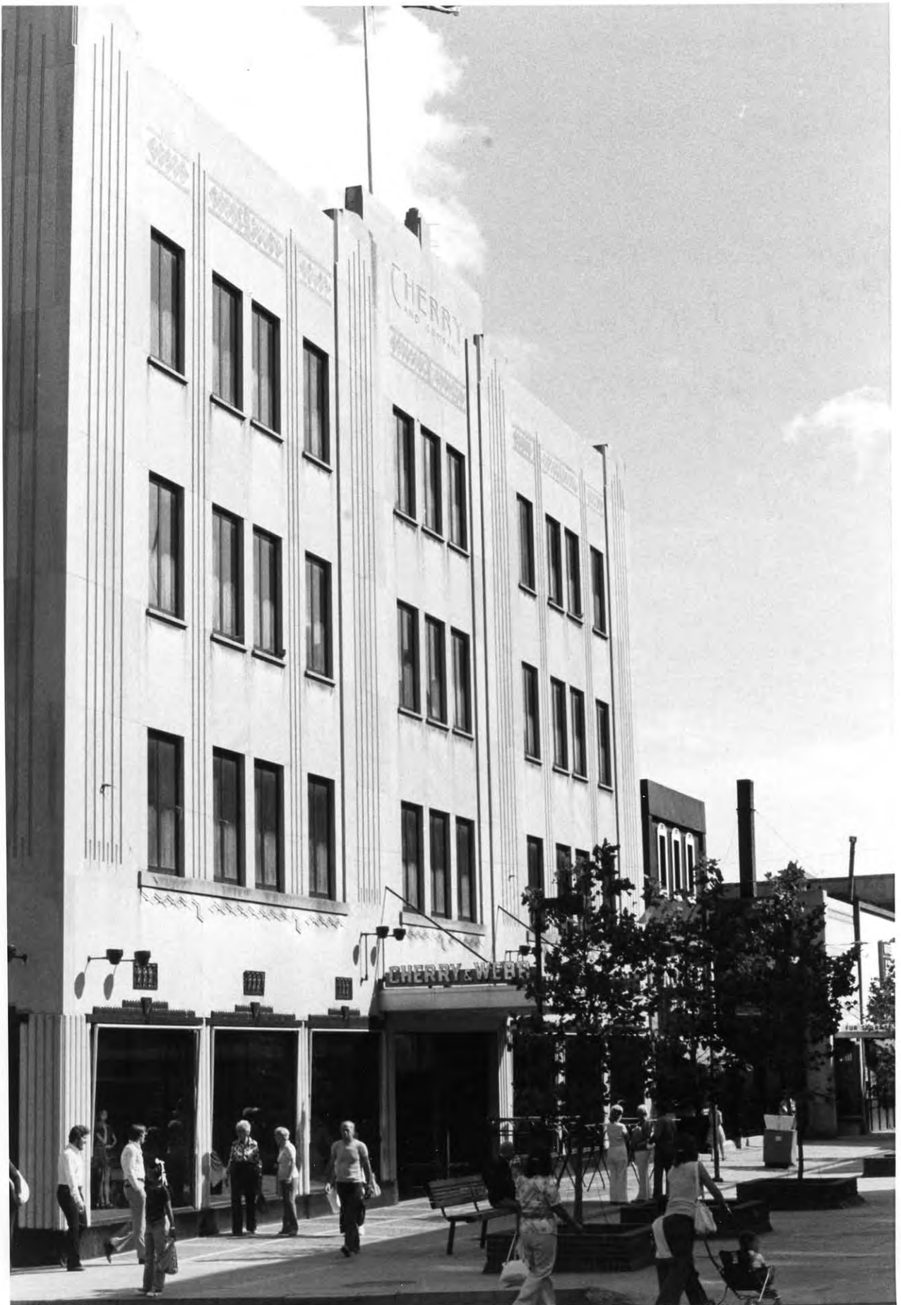
7. Cherry Building, front view, 798-800 Purchase Street; east side of Purchase St. on Mall. (1977)