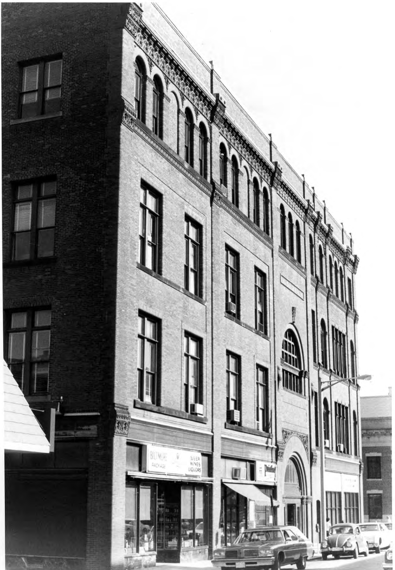
3. Duff Building, east side of Pleasant Street between Mechanics Land and William Street. (Photograph: Robin James Shields, 1977)