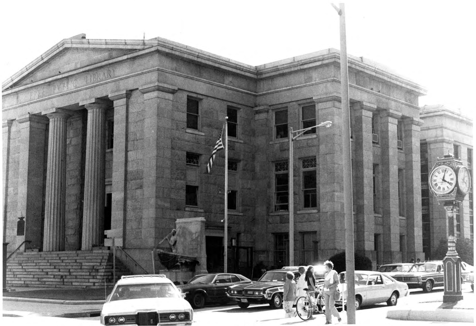
6. New Bedford Free Public Library, west side of Pleasant St. at Williams St.