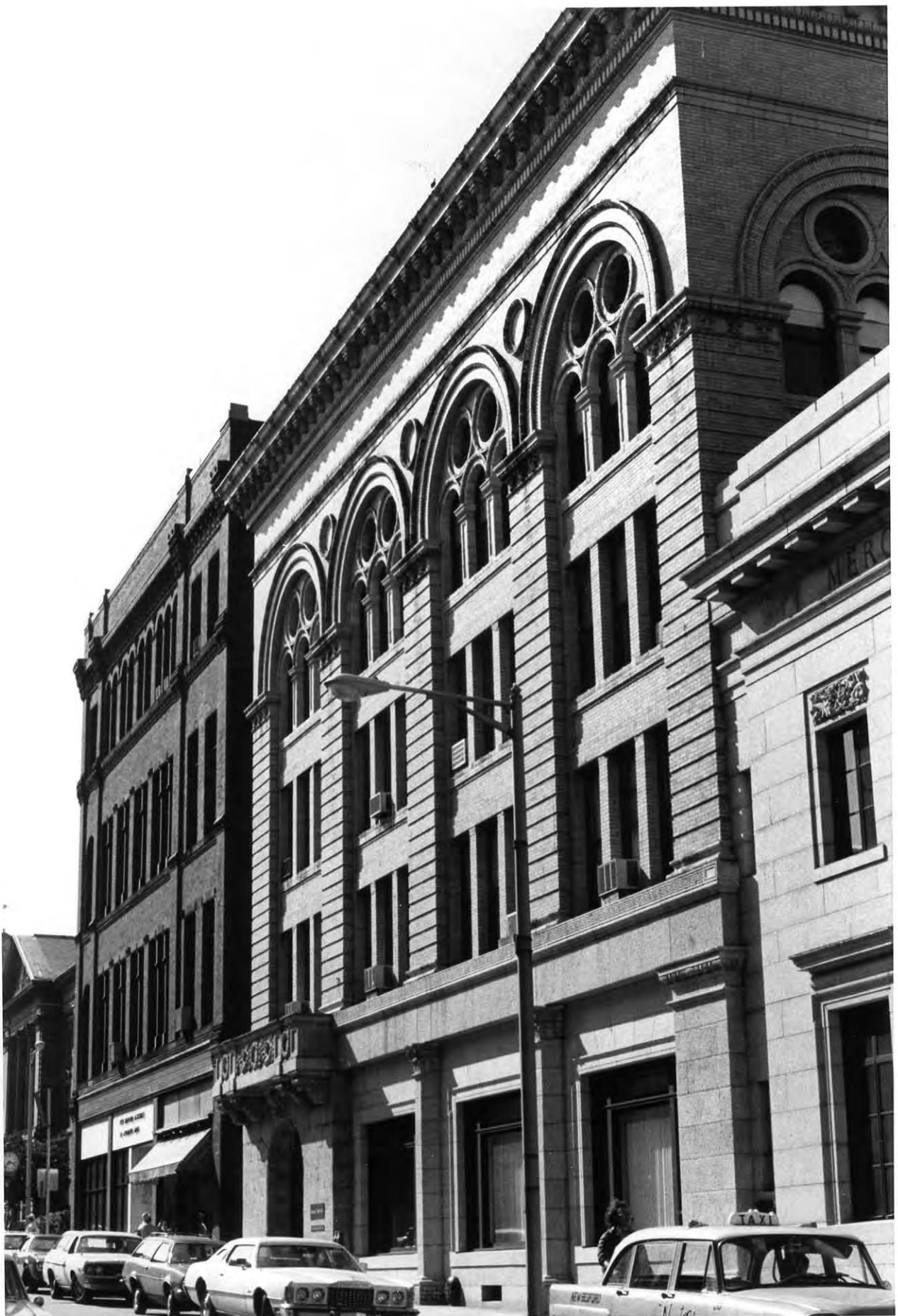
4. Merchants National Bank & North side of Duff Building, North side of William Street between Pleasant & Purchase Streets. (Photograph: Robin James Shields, 1977)