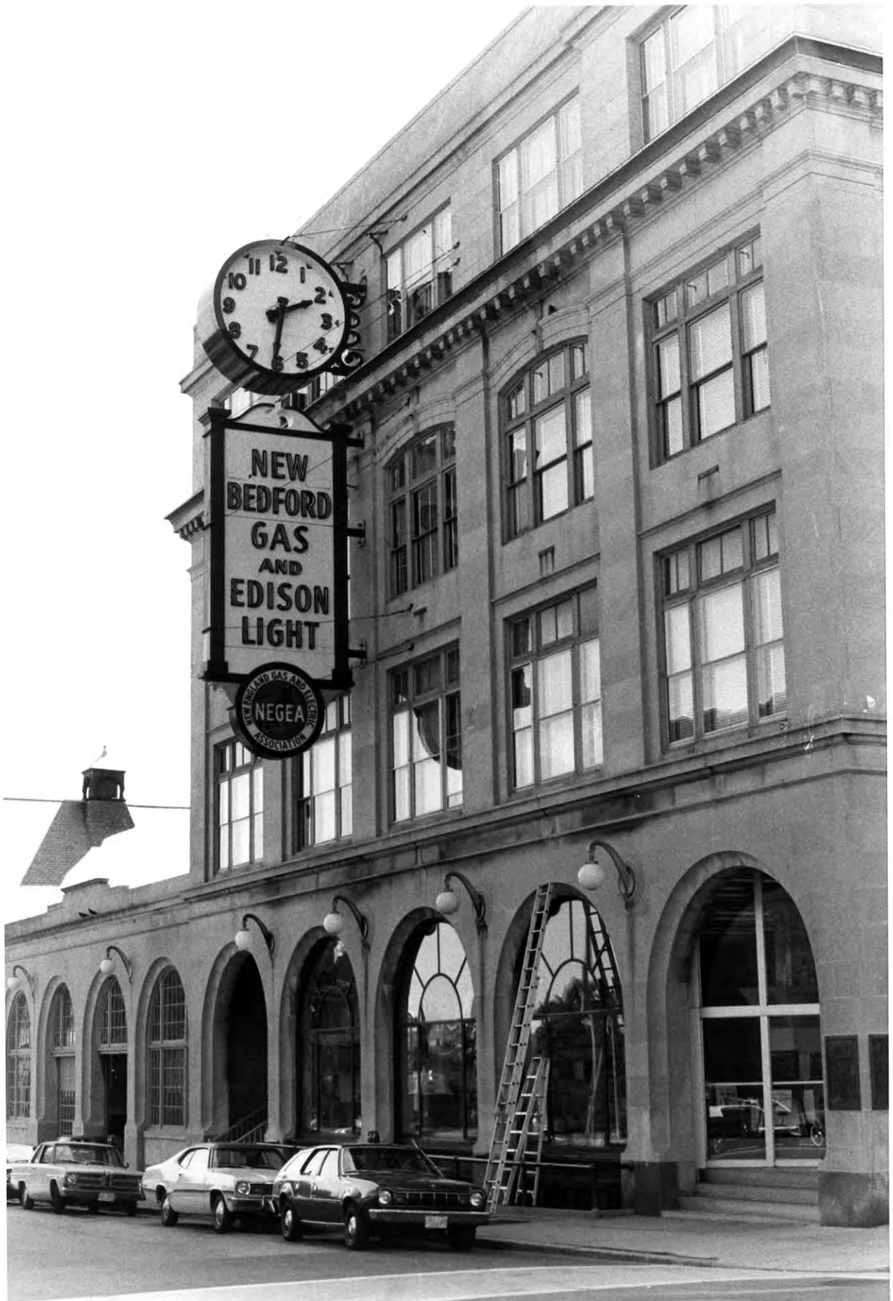
12. New Bedford Gas & Edison Light Company Building, west side of Purchase Street at Spring Street.