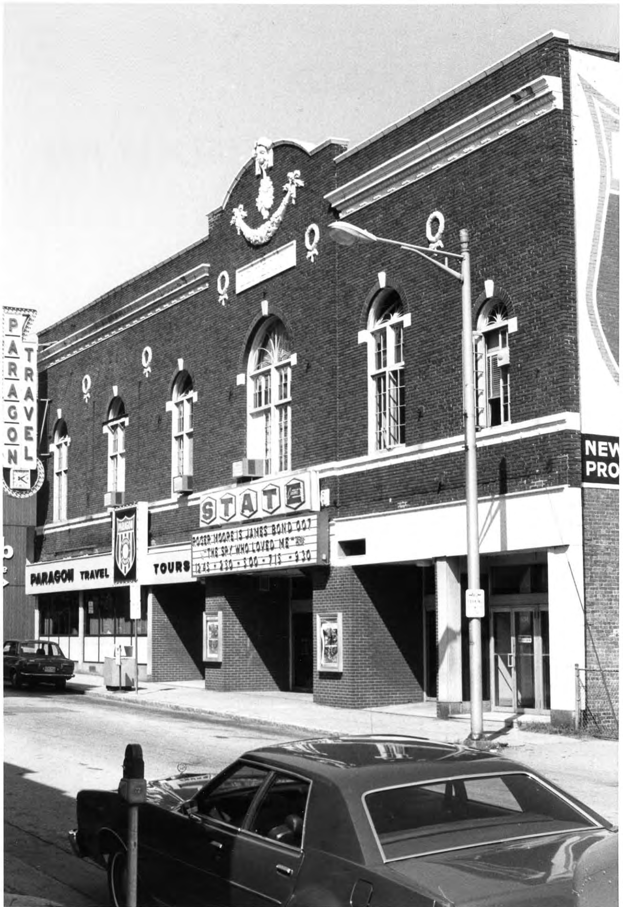
13. State Cinema, 684 Purchase St.