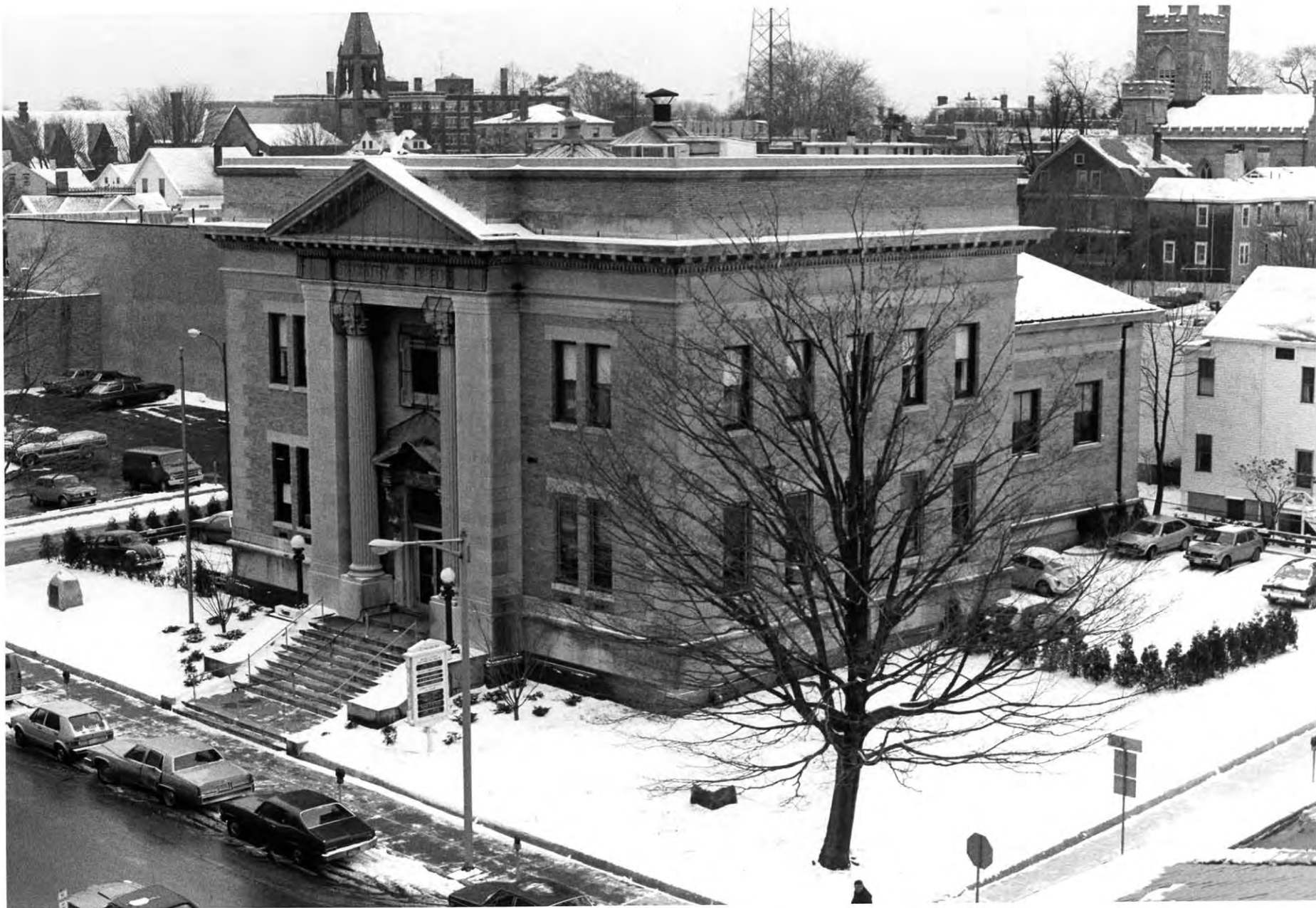
5. New Bedford Registry of Deeds, West side of North Sixth Street.