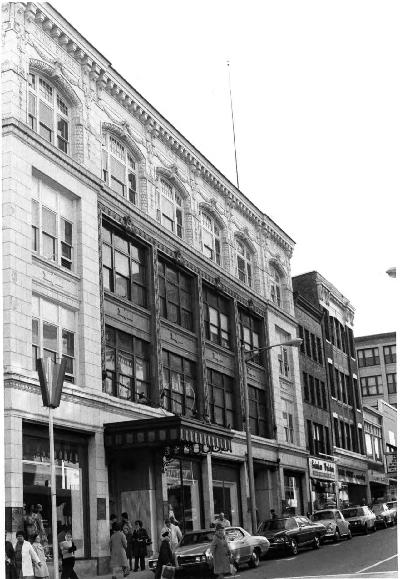
9. South side of Union Street, looking west. East-to-west: Star Shop, Scrimshaw Workshop, & Star Store Men's Shop.