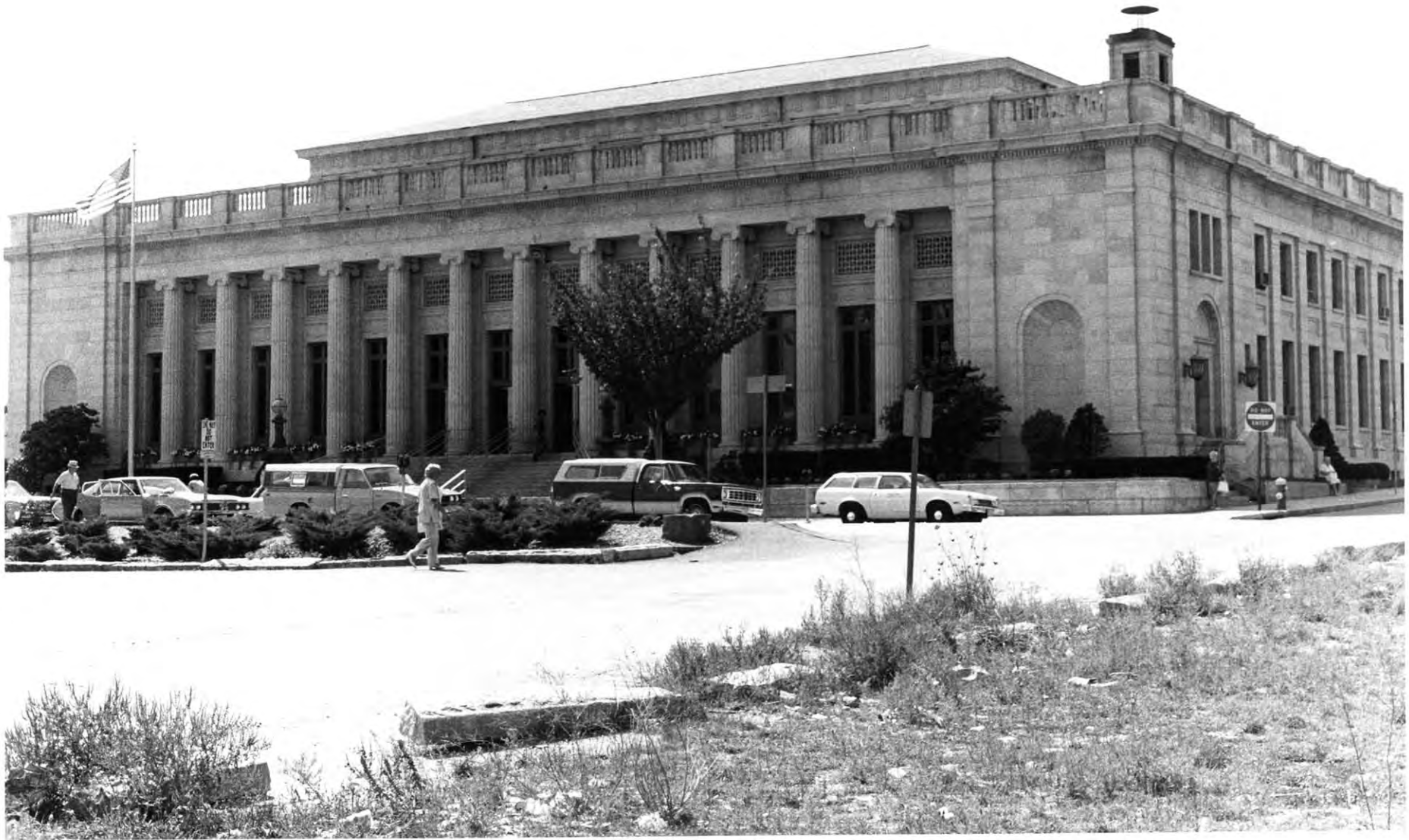
1. New Bedford Post Office, west side of Pleasant Street & South side of Middle Street.