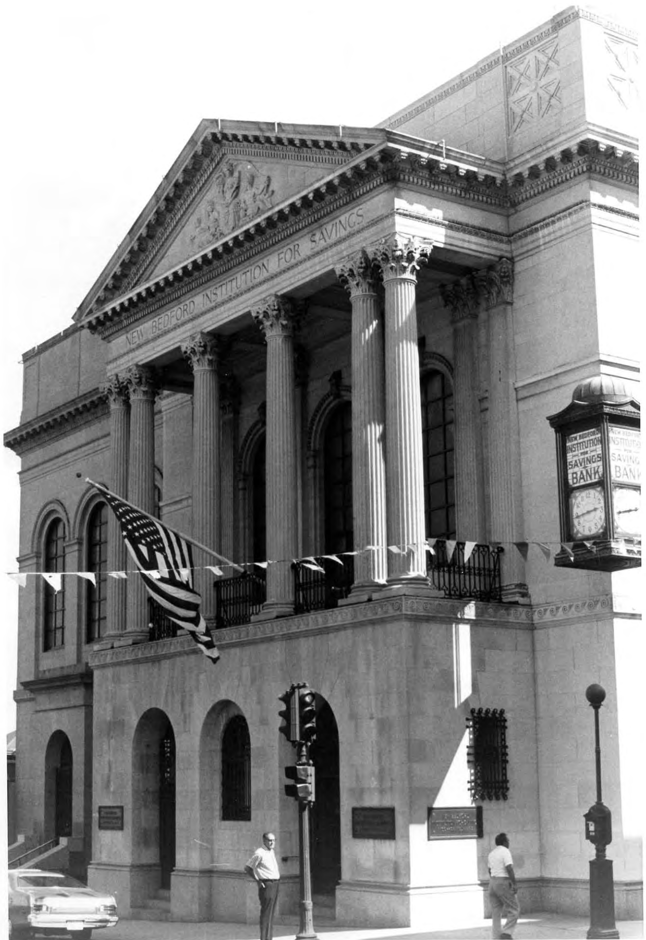
10. New Bedford Institute for Savings, 174 Union Street.