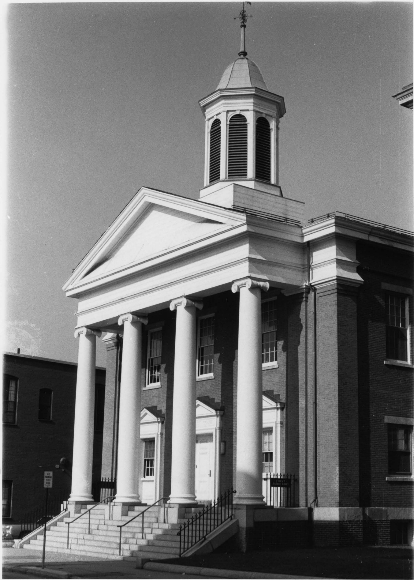
1. South facade of First District Courthouse (#1).