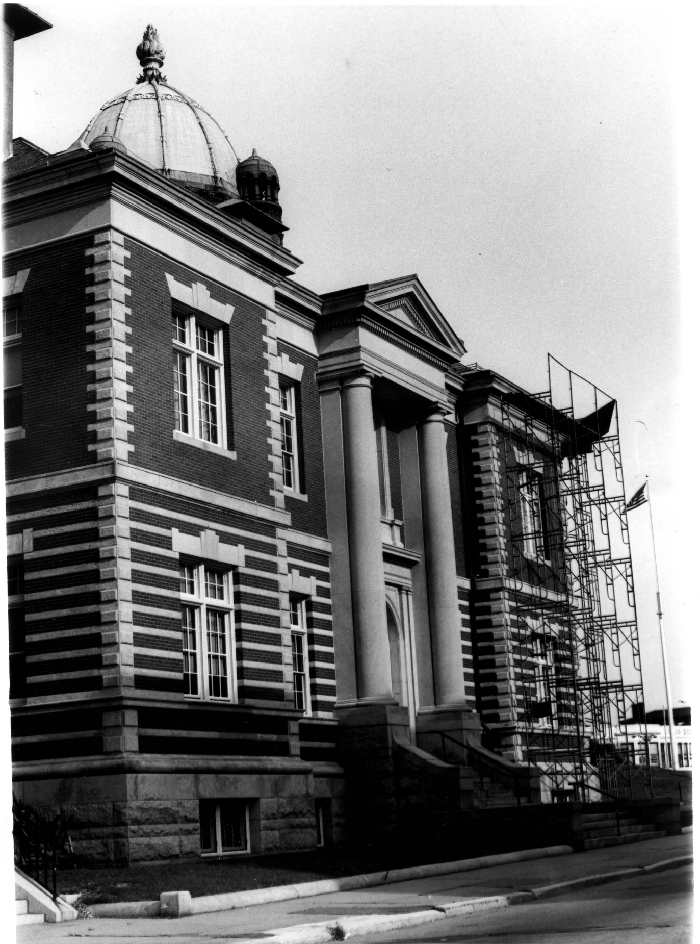
3. South facade of Registry of Deeds (#3).