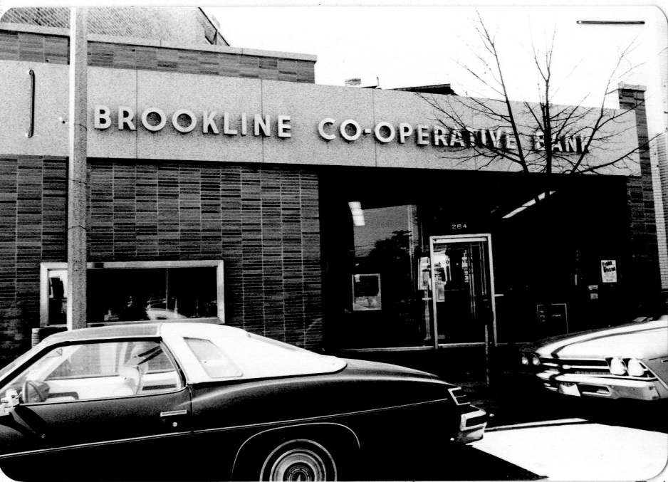
other buildings. Indicate north.

Address 264 Washington St Name Brookline Cooperative Bank Present use Bank