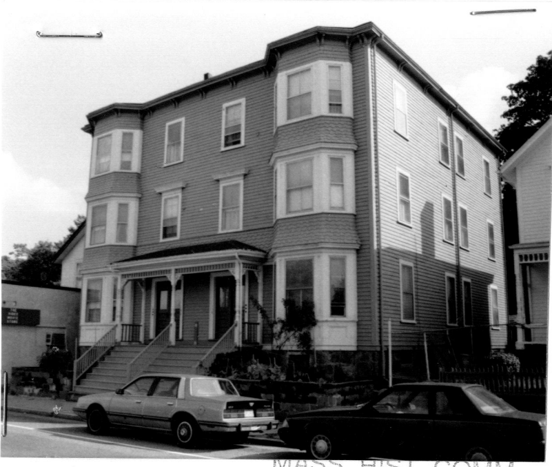
MASS. HIST. COMM.

Setting Set back from the street and on a high foundation in a dense mixed used area on a busy street; rear grade rises; rear abuts the Pill Hill NR/SR/LHD.